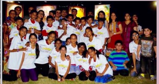
On 2 nd October Samvedana had organised a Charity Dinner. The Pathshala and Akshara kids at the joy of giving charity dinner.