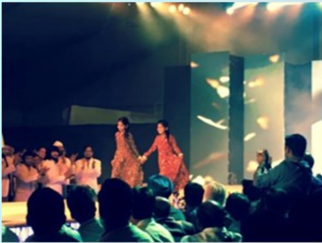
Little Samvedana Angels showstoppers at a city based mega fashion show sequence with 'Maitry' at 'adaa'.Feb 2016