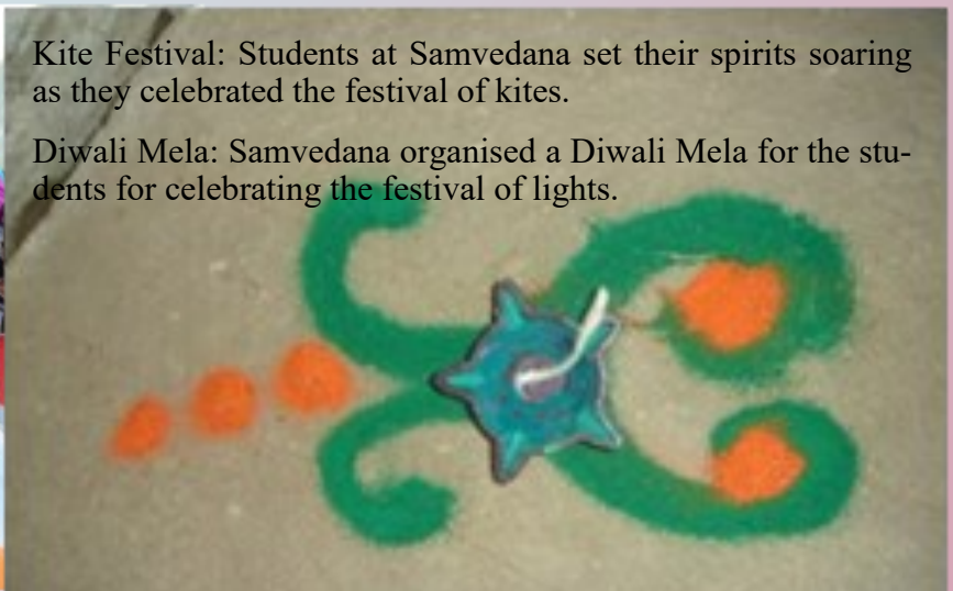
Diwali Mela: Samvedana organised a Diwali Mela for the students for celebrating the festival of lights.