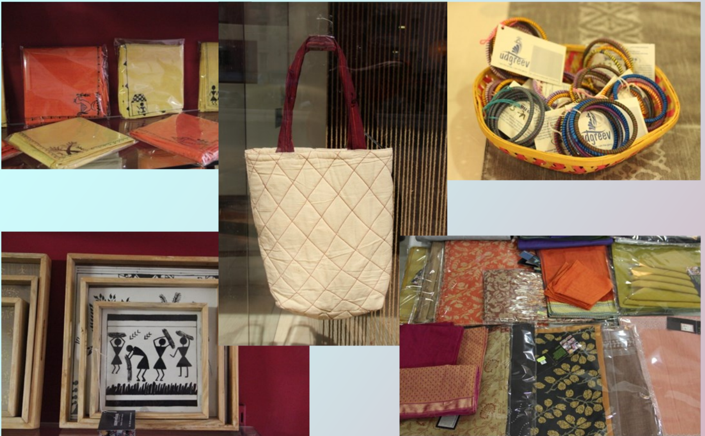
Udgreev – Workshop for Yoga Mats, Shibori and bags making was held on 21 st July, 2015.