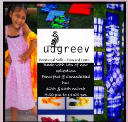
Udgreev – Femafest at Ahmedabad Haat from 12 th to 15 th March 2016