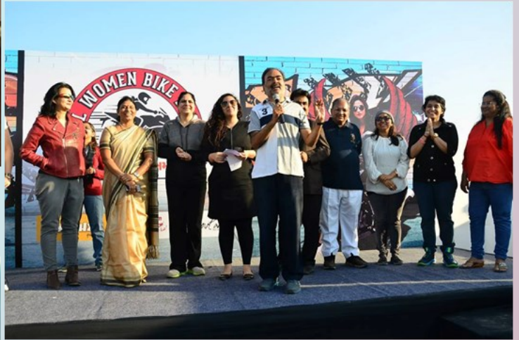
Samvedana at Women's Bike Rally