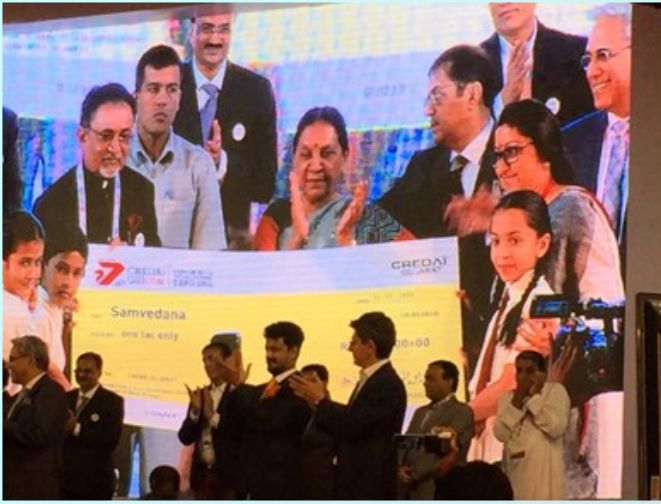
Samvedana honoured by honourable CM at Credai Gujarat convention.