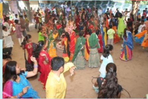
Navratri Celebration: Glamour hits Samvedana as students dance away to the tunes of garba in vibrant colours.