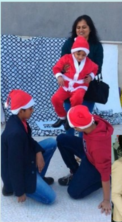
Christmas Celebration: Christmas Celebration was done with the students of Samvedana and they enjoyed the celebration through music and dance.