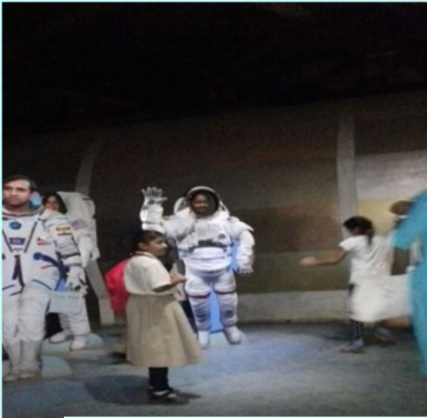
Field Trip The students at Samvedana's Vastrapur centre got a privilege to explore the Science city.