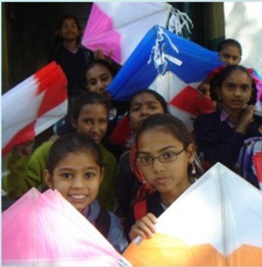
Kite Festival: Students at Samvedana set their spirits soaring as they celebrated the festival of kites.

Samvedana displayed its wish tree which showed children's and teachers' wishes and Samvedana's upcoming project requirements. This helped fulfil many of the children's wishes such as bicycles, school bags, kitchen utensils, movie trips, computers and summer camp fees.